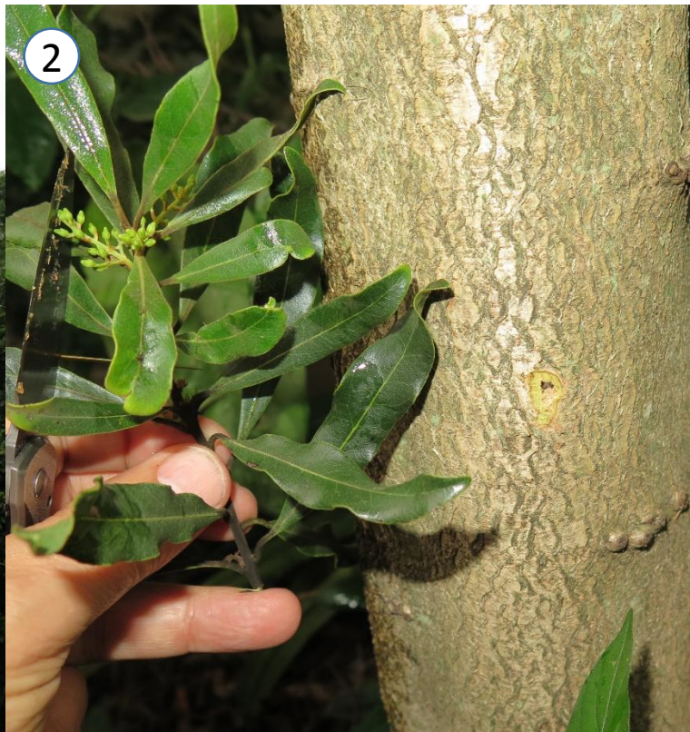
2. Picture to identify tree species including bark and leaves, and if present, flowers and seeds.