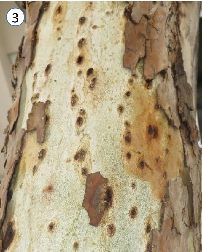
3. Zoom in on affected area to show external symptoms around entrance holes.